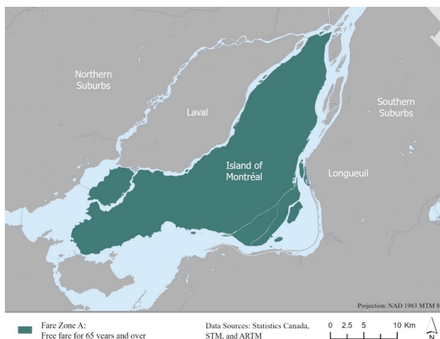
Figure 1. Region of Montréal where older adults (65+) receive a free public transit fare

(N=786), two months after the free fare was implemented (Wave 2). Only respondents residing on the island of Montréal who answered both waves of the survey completely (N=427) are included in our analysis.