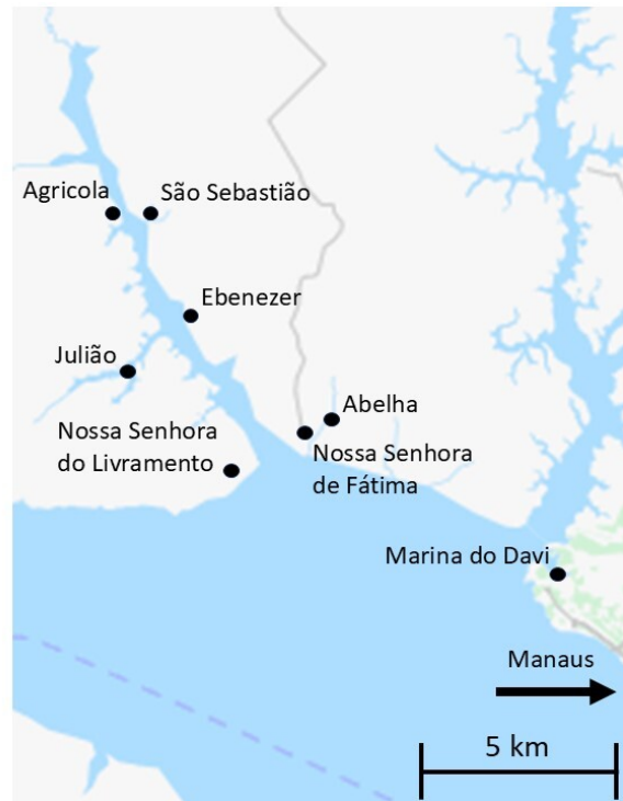
Figure 2. Map of Marina do Davi, Manaus, and surrounding road-disconnected communities served by river transport.

Trips were directional and followed a stable sequence of communities, typically beginning with the settlement closest to Manaus and proceeding toward more distant communities within the inlet. This order of stops was consistent across observed trips. At any given time during operating hours observed, two to three cooperative vessels were typically present at Marina do Davi, and vessels were almost always at or near full capacity before departure. Outside Marina do Davi, more than one cooperative vessel was never observed waiting for passengers, suggesting that passenger accumulation occurs primarily at the hub rather than at community-level boarding points.