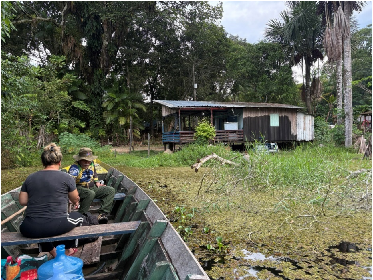
Figure 3. Type 3 wooden boat approaching typical residence with stilt foundation in Nossa Senhora do Livramento

uncommon to observe family members meeting arriving passengers at ferry stops and transporting them onward by wooden boat to residences or nearby settlements. Their small size and ease of navigating in shallow waters make them ideal for transportation within the seasonally flooded igapó forest in the inlets in the region.