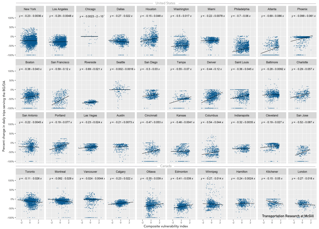
Figure 2: Percentage change in number of trips crossing a Census Block or a Dissemination Area and vulnerability index (trend line equation showing as proportion)