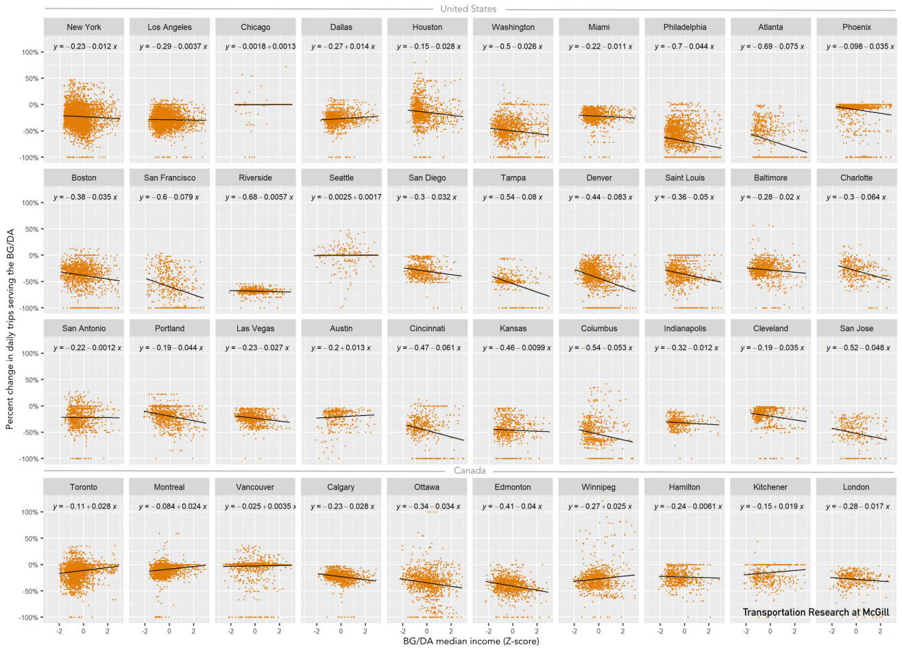
Figure 1: Percentage change in number of trips stopping in a Census Block or a Dissemination Area and Z-score of income (trend line equation showing as proportion)